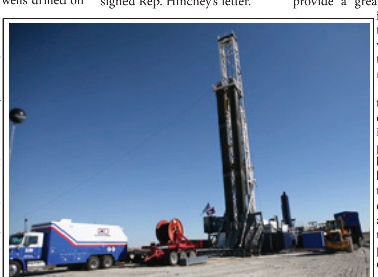
"Communities across America have seen their water contami- Drinking Water press job creation nated by the chemicals used in the hydraulic fracturing pro-

A back-of-the-envelope analysis of campaign finance dollars contributed to the members of Congress who are speaking out on the issue shows that the Natural Gas Caucus received 19 times more money from the oil and gas industry between 2009 and 2010<sup>[5]</sup> than the group who signed Rep. Hinchey's letter.