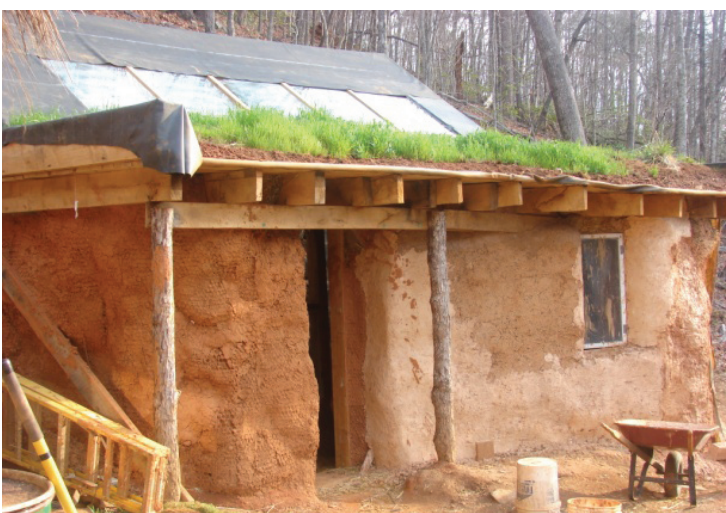
The Amoeba in North Carolina.

Rod Rylander, designer and builder of the well known Hobbit House in Earthaven Ecovillage in North Carolina and who has experience in building most alternative-style structures, will present the workshop along with villagers who are experts in tropical construction. Participants will gain experience in adobe, cordwood, tire, cob, rammed earth, stick walls, thatch roofs and natural plasters and floors. This four-day workshop fee is $400 per person ($700 per couple) and includes hands-on experience in designing and constructing alternative buildings.