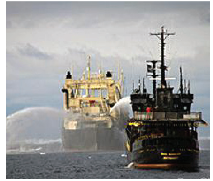
The Sea Shepherd ship Bob Barker blocks the Japanese factory ship's slipway so it cannot load dead whales, February 10, 2011.

The continent of Antarctica is like a big round table with the Nisshin Maru and the Bob Barker circling clockwise from west to east. If this is their intention I will send the Steve Irwin and the Gojira westward counter clock-