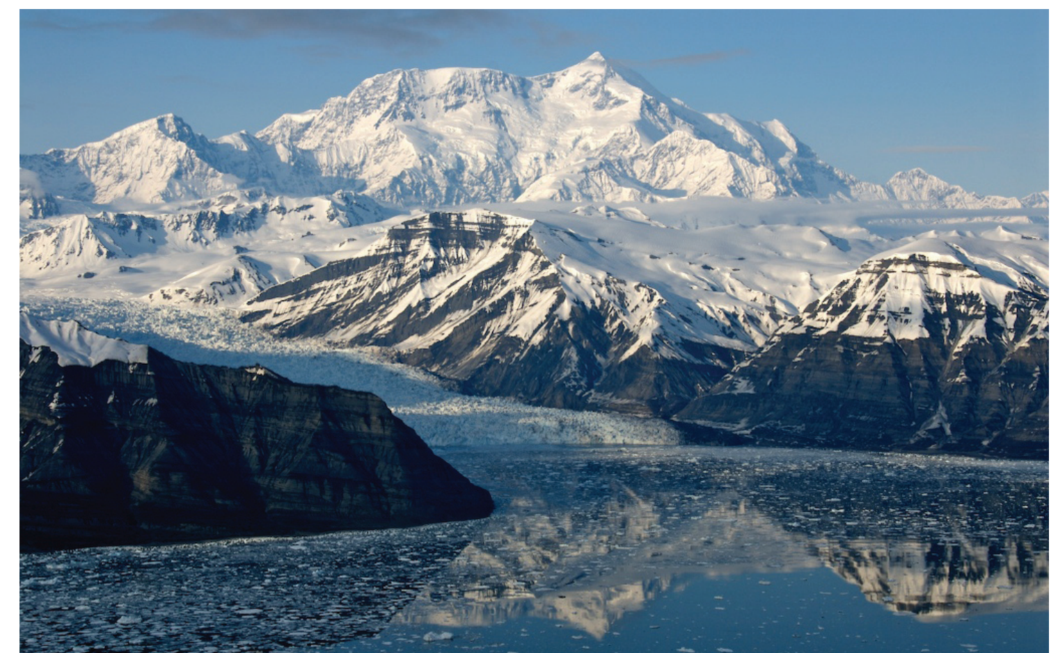
Icy Bay, Yahtse Glacier and Mount Saint Elias.