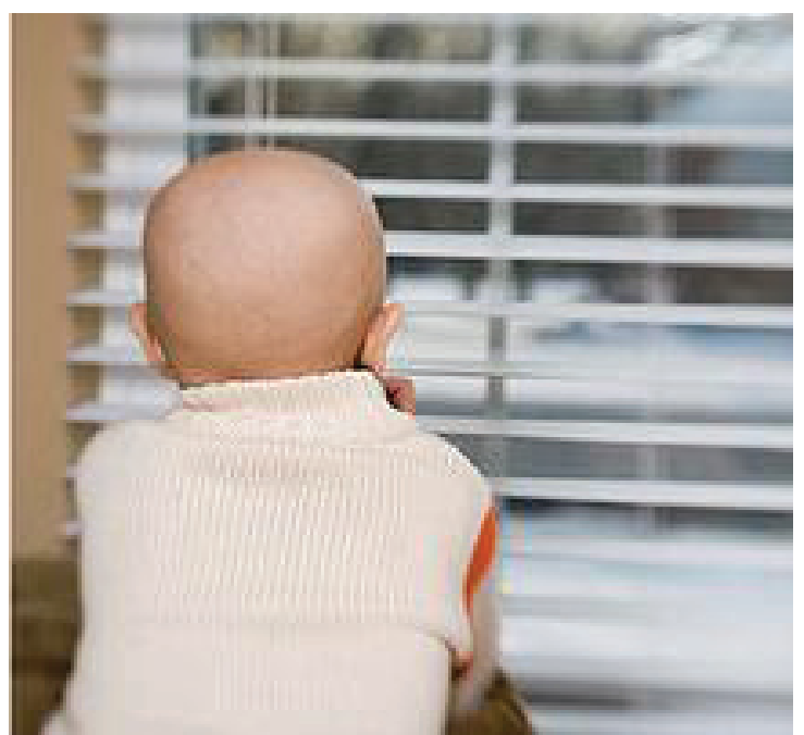
Incidences of childhood cancer are increasing across the United States. This toddler is not having a normal life.

WASHINGTON, D.C., January 26, 2011 (ENS) — Bipartisan legislation was introduced in Congress today to help communities determine whether there is a connection between clusters of cancer, birth defects and other diseases, and contaminants in the surrounding environment.