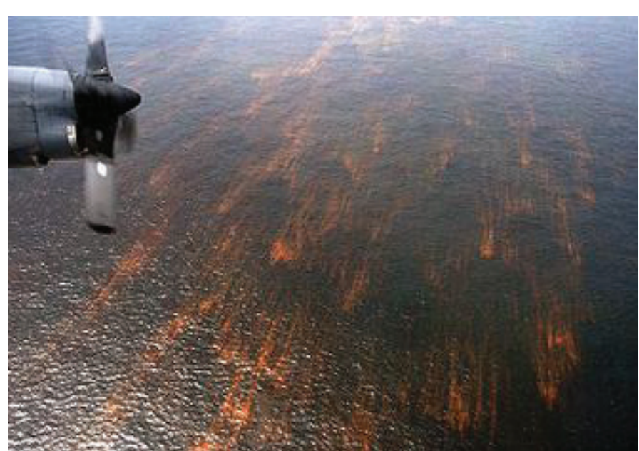
Oil streaks on the Gulf of Mexico near the Deepwater Horizon blowout off the