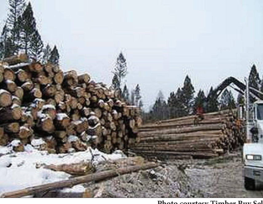
Logs cut from the Beaverhead Deerlodge National Forest.

District Judge Donald Molloy denied the plaintiffs' request for a preliminary