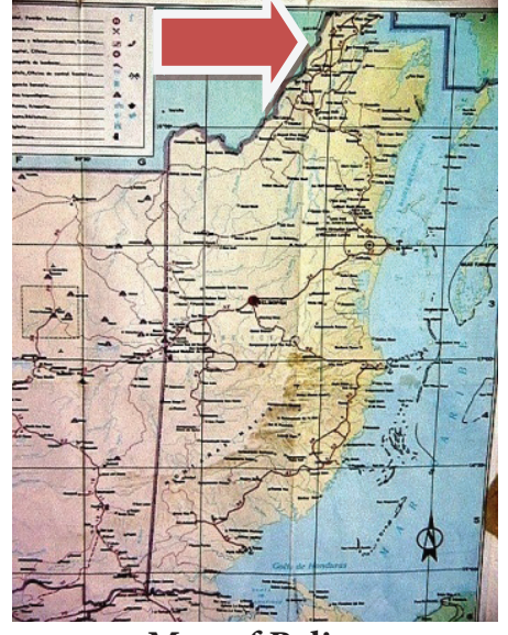
Map of Belize Aarrow points to San Antonio