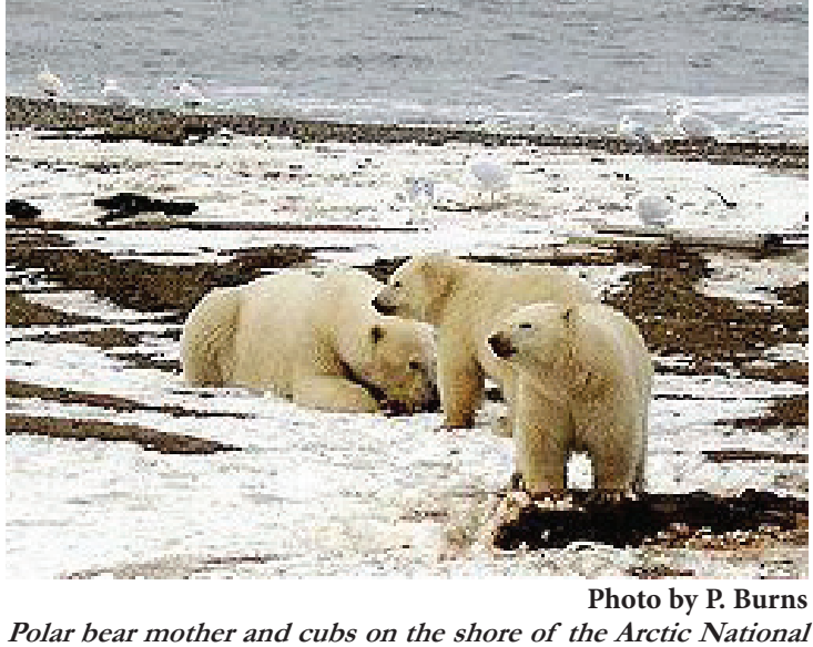
Wildlife Refuge overlooking the Beaufort Sea.

The drilling was planned for waters just offshore the Arctic