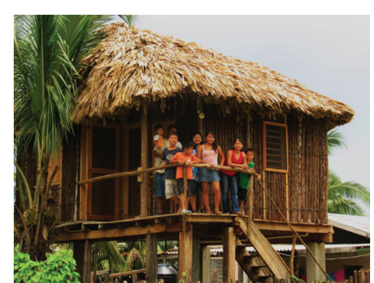
Villagers outside of one of the cabanas for rent.

Cabana: Two rooms elevated eight feet above the flood plain and overlooking the river take advantage of the breezes off the river. Each room has a private bathroom with flush toilet and shower. Windows and doors have screening. Fans are provided. The Cabana is